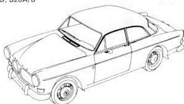
130 (121, 122S, 123GT) (2-dörrars, 2-doors) B18A/B/D, B20A/B

In total 5,184 produced 1957s, 9,815 1958s, 18,000 1959s, 21,400 1960s and 29,900 1961s.