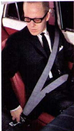
Three-point seat belt and grab handle.