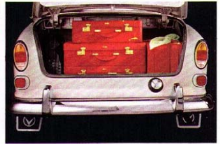
Large, fully lined trunk space.