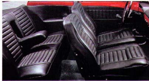
Comfort for five, luxury for four.