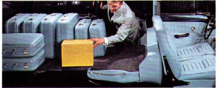
The Volvo 122 S Station Wagon does everything the Sedans do. It just carries more kids, shrubbery, packages etc., while doing it.