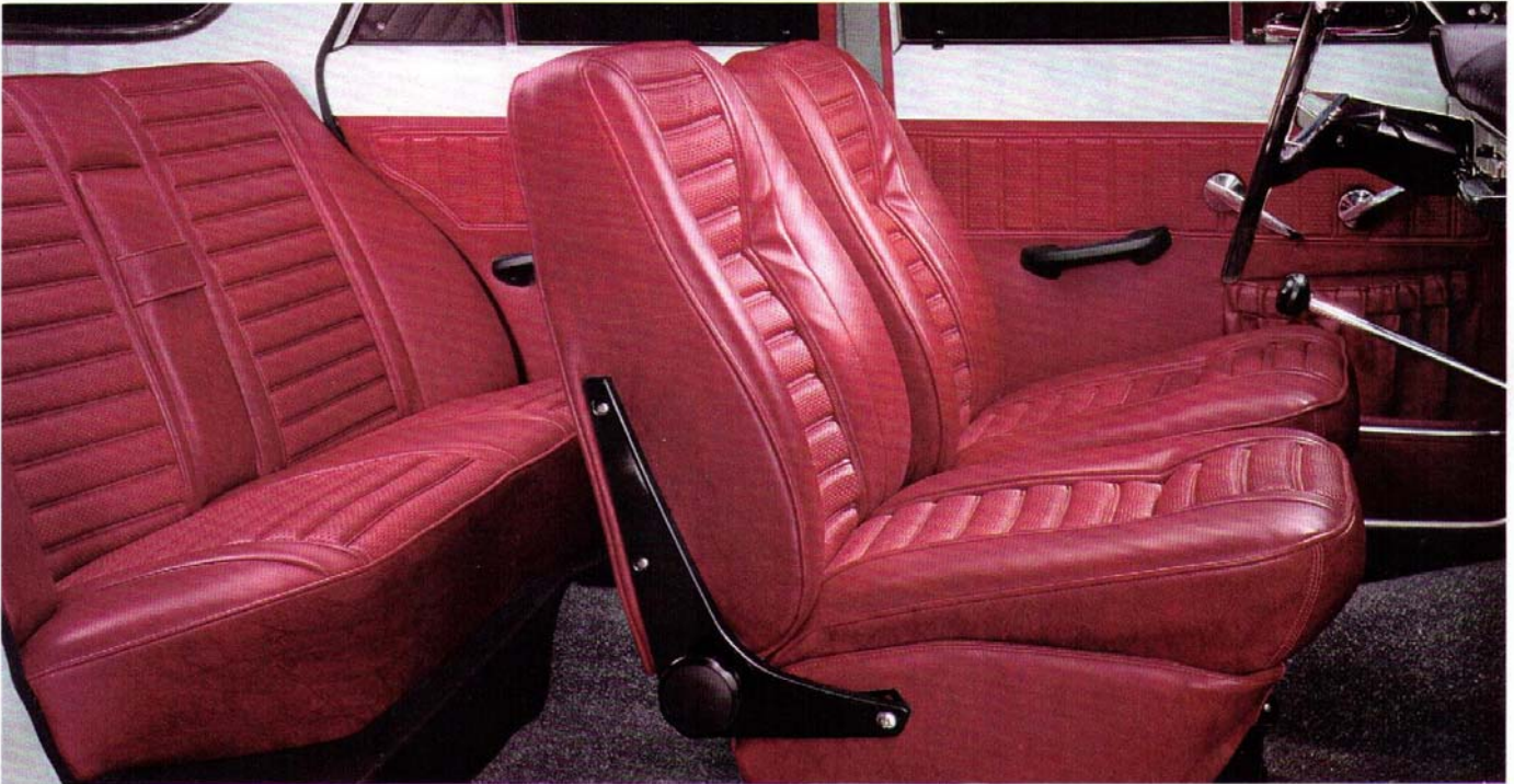
The new front seats are almost infinitely adjustable in all directions.