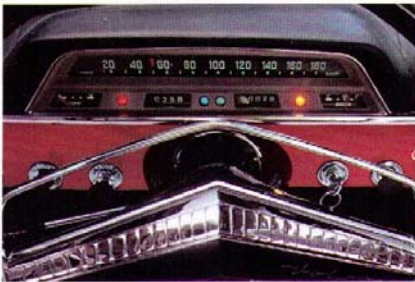
Easy to read instruments.